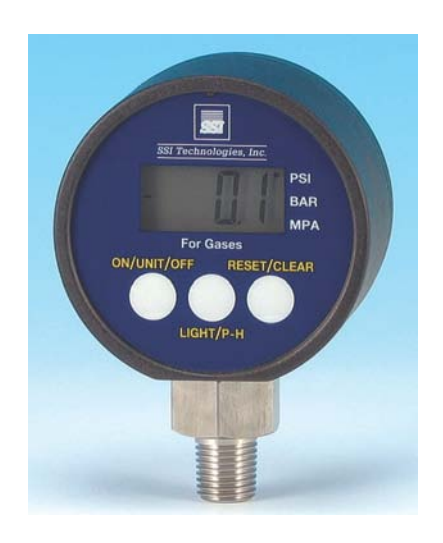
MediaGauge™ Model MG-9Vand Model MG-9V-F

The MediaGauge™ MG-9V digital pressure gauge has better accuracy, longer life and standard multiple functions which make it a better choice than mechanical pressure gauges.